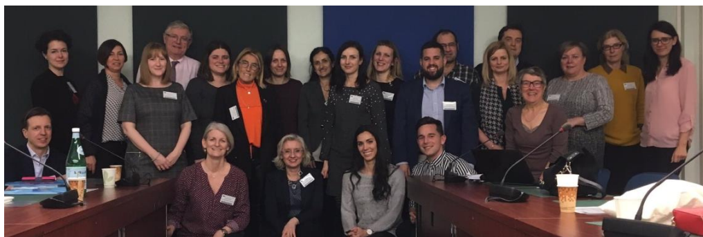
SCIROCCO Exchange Kick-Off Meeting 5 th -6 th February 2019

In the coming months the SCIROCCO Exchange partners will be developing effective collaborative interaction between Work Packages and contribute to the preparation of the project's dissemination materials and website. In addition to the development of the Knowledge Management Hub and Evaluation Framework, the self-assessments will be undertaken in 9 European regions for the maturity assessment for integrated care in these regions.